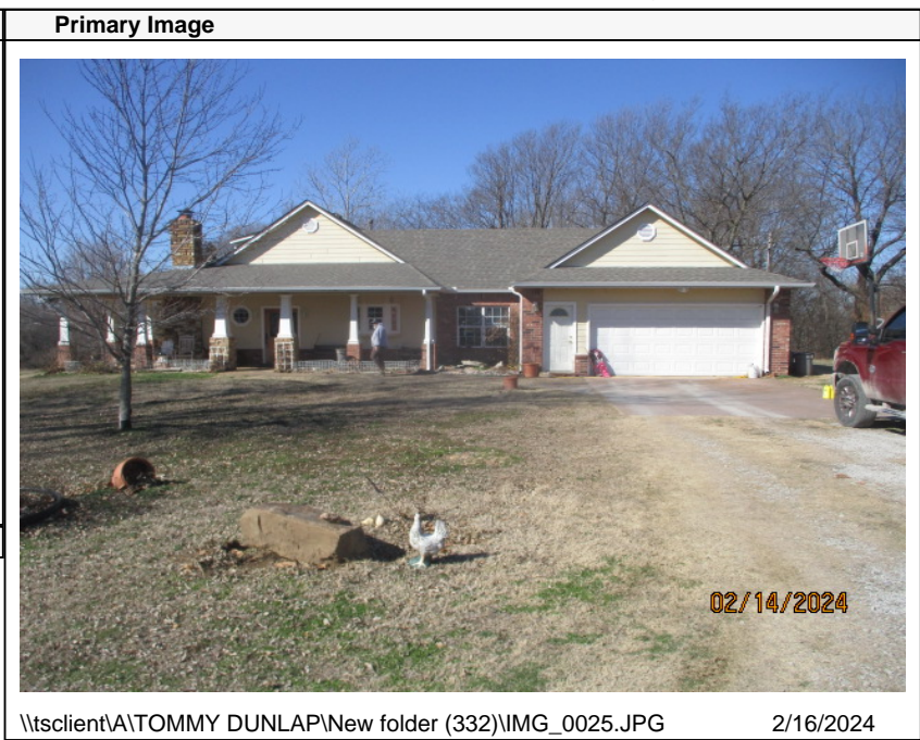
\\tsclient\A\TOMMY DUNLAP\New folder (332)\IMG_0025.JPG 2/16/2024