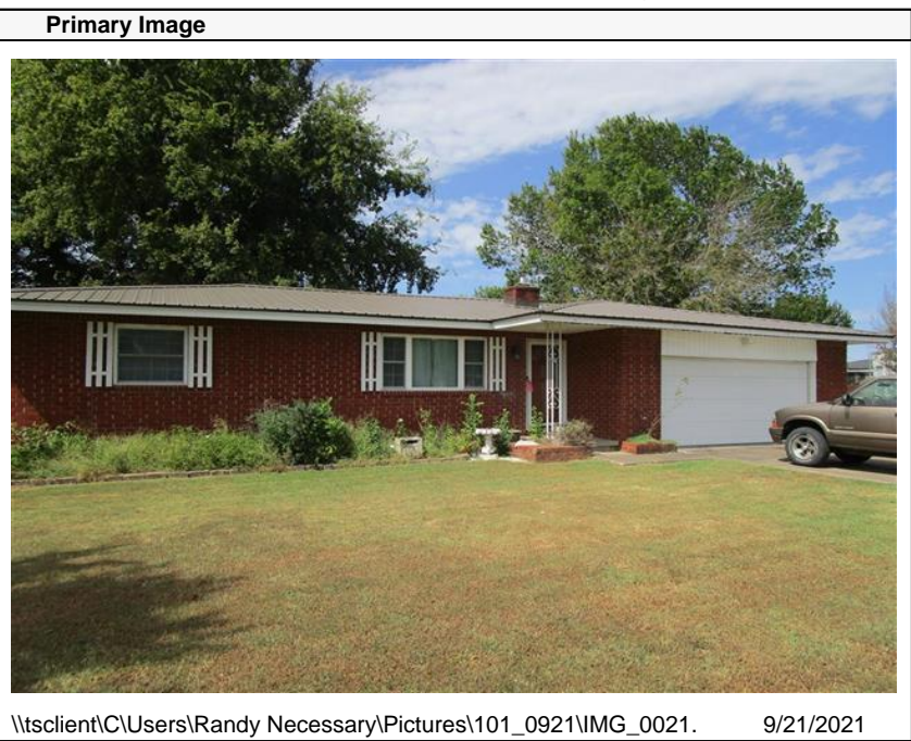
\\tsclient\C\Users\Randy Necessary\Pictures\101_0921\IMG_0021. 9/21/2021