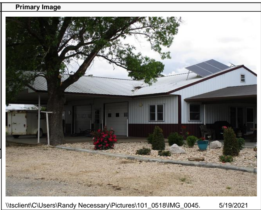
\\tsclient\C\Users\Randy Necessary\Pictures\101_0518\IMG_0045. 5/19/2021