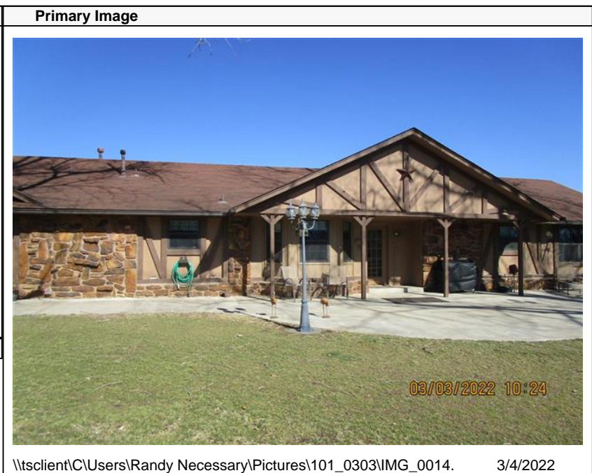
\\tsclient\C\Users\Randy Necessary\Pictures\101_0303\IMG_0014. 3/4/2022