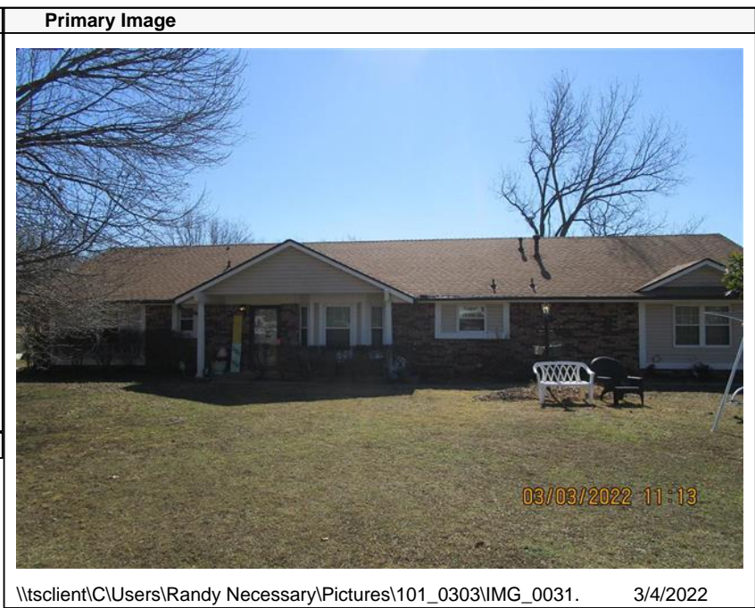
\\tsclient\C\Users\Randy Necessary\Pictures\101_0303\IMG_0031. 3/4/2022