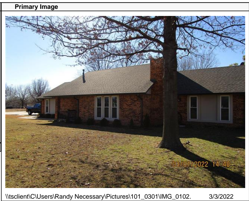
\\tsclient\C\Users\Randy Necessary\Pictures\101_0301\IMG_0102. 3/3/2022