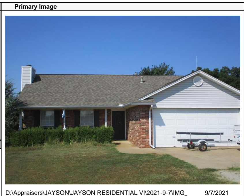
D:\Appraisers\JAYSON\JAYSON RESIDENTIAL VI\2021-9-7\IMG_ 9/7/2021