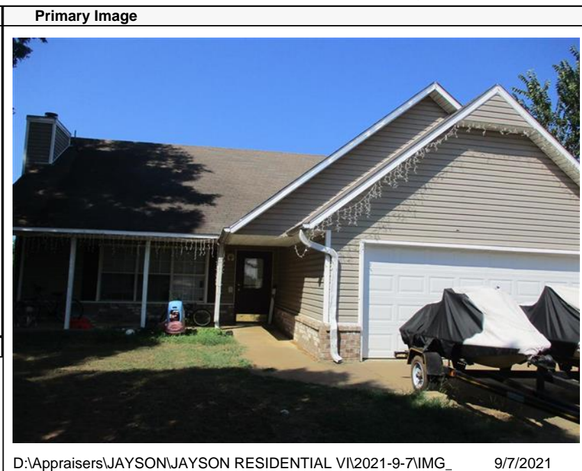
D:\Appraisers\JAYSON\JAYSON RESIDENTIAL VI\2021-9-7\IMG_ 9/7/2021