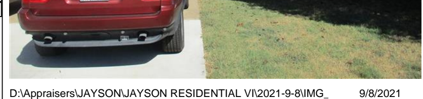
D:\Appraisers\JAYSON\JAYSON RESIDENTIAL VI\2021-9-8\IMG_ 9/8/2021