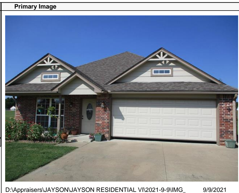
D:\Appraisers\JAYSON\JAYSON RESIDENTIAL VI\2021-9-9\IMG_ 9/9/2021