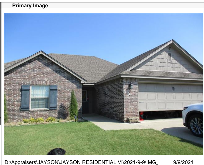
D:\Appraisers\JAYSON\JAYSON RESIDENTIAL VI\2021-9-9\IMG_ 9/9/2021