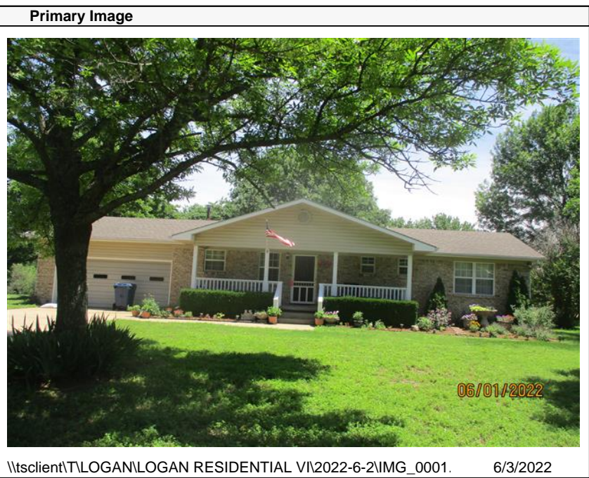
\\tsclient\T\LOGAN\LOGAN RESIDENTIAL VI\2022-6-2\IMG_0001. 6/3/2022