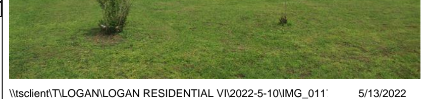
\\tsclient\T\LOGAN\LOGAN RESIDENTIAL VI\2022-5-10\IMG_011' 5/13/2022