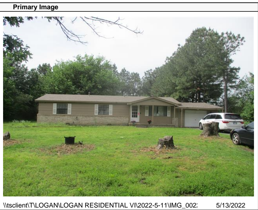
\\tsclient\T\LOGAN\LOGAN RESIDENTIAL VI\2022-5-11\IMG_002: 5/13/2022