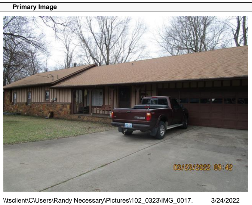
\\tsclient\C\Users\Randy Necessary\Pictures\102_0323\IMG_0017. 3/24/2022