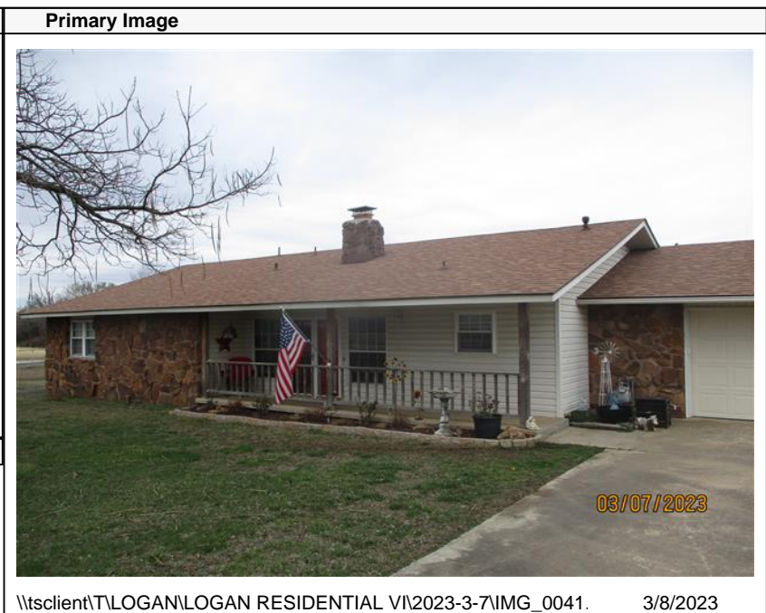
\\tsclient\T\LOGAN\LOGAN RESIDENTIAL VI\2023-3-7\IMG_0041. 3/8/2023