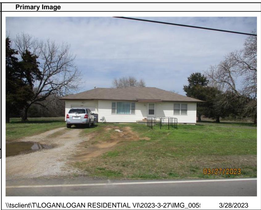
\\tsclient\T\LOGAN\LOGAN RESIDENTIAL VI\2023-3-27\IMG_005! 3/28/2023