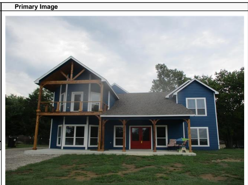
\\tsclient\T\BUFFY\BUFFY NEW CONST\09022020\IMG_0013.JPG 9/2/2020