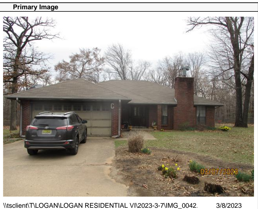
\\tsclient\T\LOGAN\LOGAN RESIDENTIAL VI\2023-3-7\IMG_0042. 3/8/2023