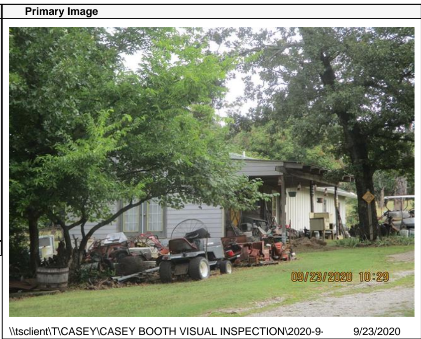
\\tsclient\TCASEY\CASEY BOOTH VISUAL INSPECTION\2020-9- 9/23/2020