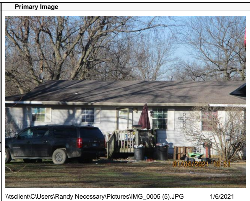
\\tsclient\C\Users\Randy Necessary\Pictures\IMG_0005 (5).JPG 1/6/2021