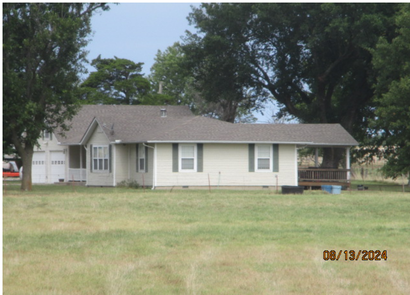
\\tsclient\T\TOMMY DUNLAP\New folder (369)\IMG_0002.JPG 8/14/2024

Method Units-Buildable Base Lot Value Factor Value Adjustments Lot Value