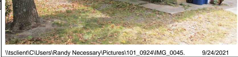
\\tsclient\C\Users\Randy Necessary\Pictures\101_0924\IMG_0045. 9/24/2021