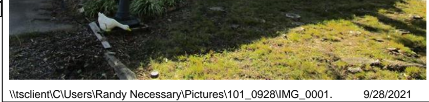
\\tsclient\C\Users\Randy Necessary\Pictures\101_0928\IMG_0001. 9/28/2021