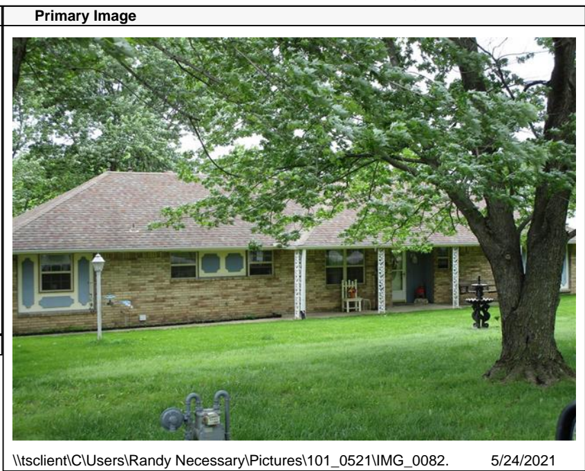
\\tsclient\C\Users\Randy Necessary\Pictures\101_0521\IMG_0082. 5/24/2021