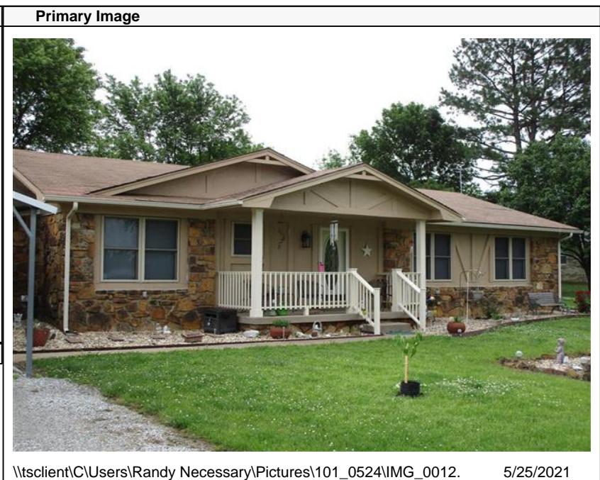
\\tsclient\C\Users\Randy Necessary\Pictures\101_0524\IMG_0012. 5/25/2021