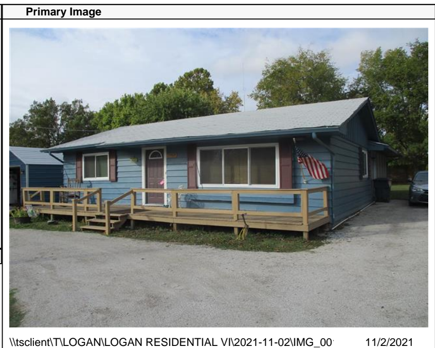
\\tsclient\T\LOGAN\LOGAN RESIDENTIAL VI\2021-11-02\IMG_00 11/2/2021