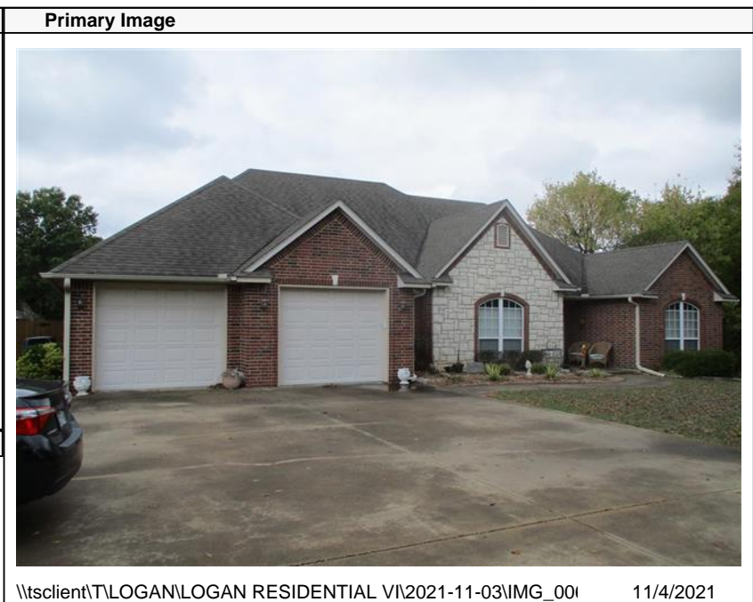
\\tsclient\T\LOGAN\LOGAN RESIDENTIAL VI\2021-11-03\IMG_001 11/4/2021