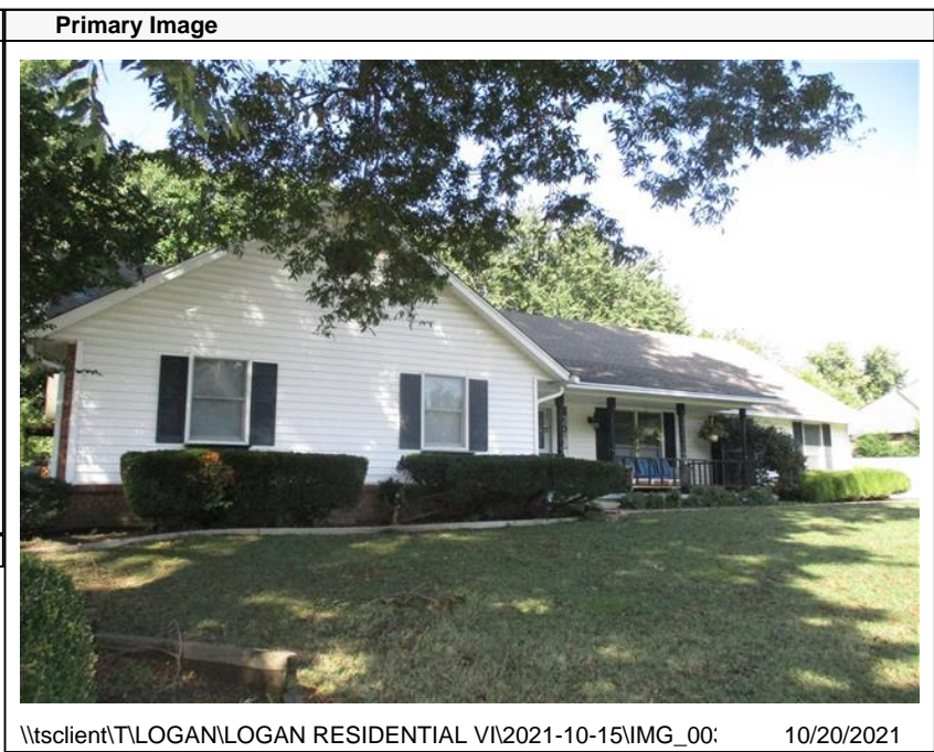
\\tsclient\T\LOGAN\LOGAN RESIDENTIAL VI\2021-10-15\IMG_00: 10/20/2021