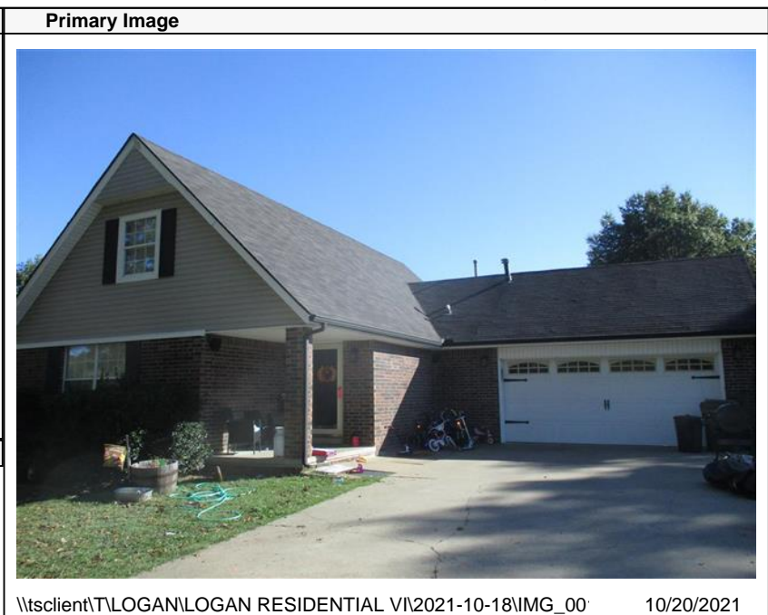
\\tsclient\T\LOGAN\LOGAN RESIDENTIAL VI\2021-10-18\IMG_00 10/20/2021