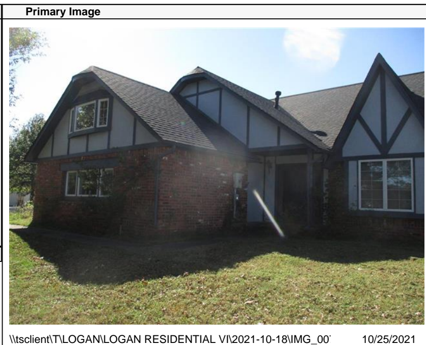
\\tsclient\T\LOGAN\LOGAN RESIDENTIAL VI\2021-10-18\IMG_00' 10/25/2021