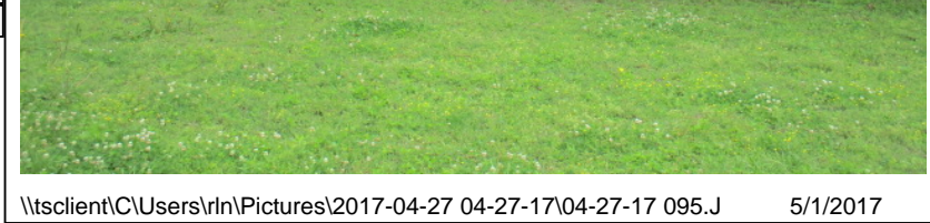
\\tsclient\C\Users\rln\Pictures\2017-04-27 04-27-17\04-27-17 095.J 5/1/2017