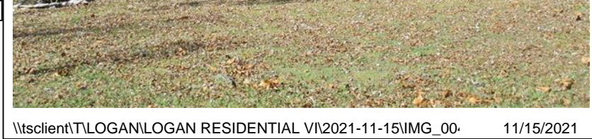
\\tsclient\T\LOGAN\LOGAN RESIDENTIAL VI\2021-11-15\IMG_00 11/15/2021