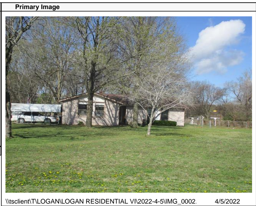
\\tsclient\T\LOGAN\LOGAN RESIDENTIAL VI\2022-4-5\IMG_0002. 4/5/2022