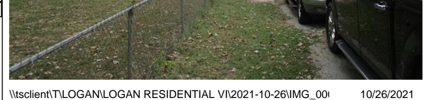
\\tsclient\T\LOGAN\LOGAN RESIDENTIAL VI\2021-10-26\IMG_001 10/26/2021