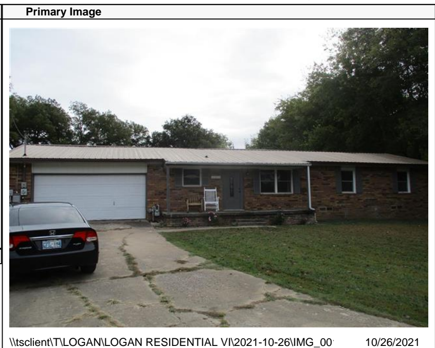
\\tsclient\T\LOGAN\LOGAN RESIDENTIAL VI\2021-10-26\IMG_00 10/26/2021