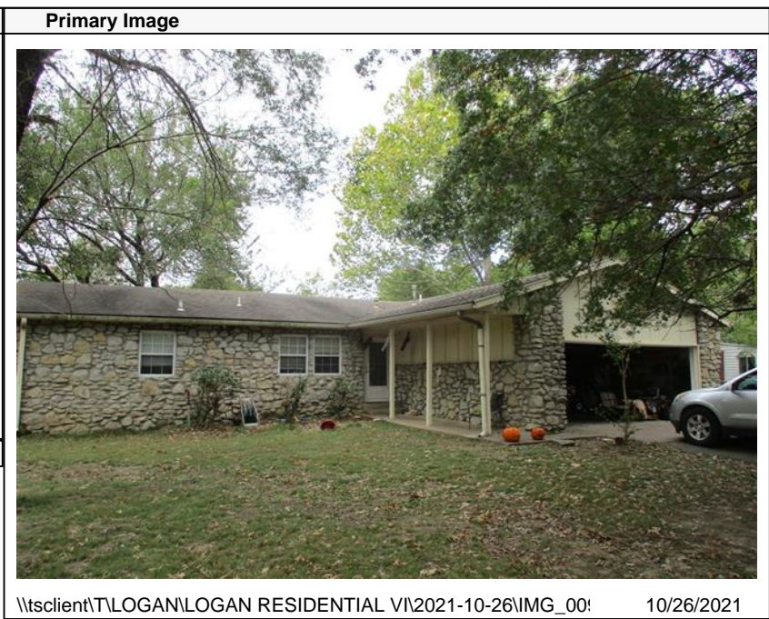
\\tsclient\T\LOGAN\LOGAN RESIDENTIAL VI\2021-10-26\IMG_00! 10/26/2021