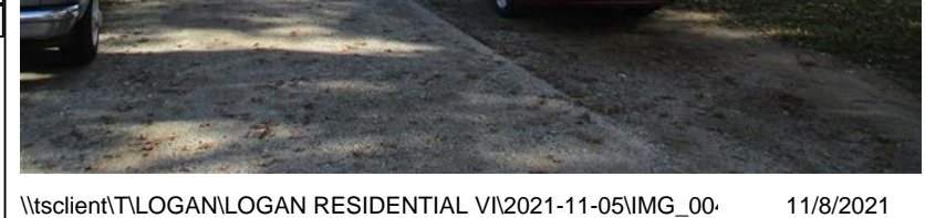
\\tsclient\T\LOGAN\LOGAN RESIDENTIAL VI\2021-11-05\IMG_00 11/8/2021