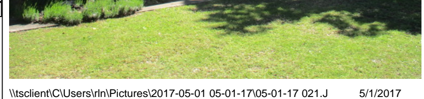
\\tsclient\C\Users\rln\Pictures\2017-05-01 05-01-17\05-01-17 021.J 5/1/2017