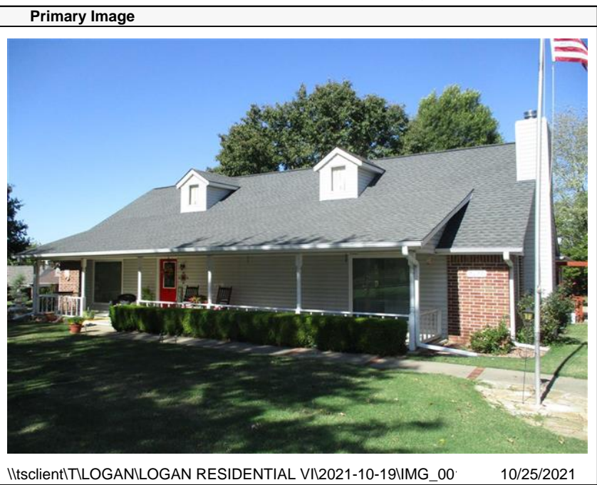
\\tsclient\T\LOGAN\LOGAN RESIDENTIAL VI\2021-10-19\IMG_00 10/25/2021