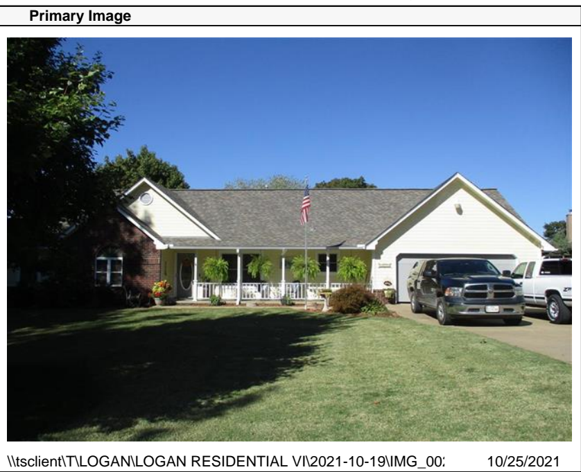
\\tsclient\T\LOGAN\LOGAN RESIDENTIAL VI\2021-10-19\IMG_00; 10/25/2021