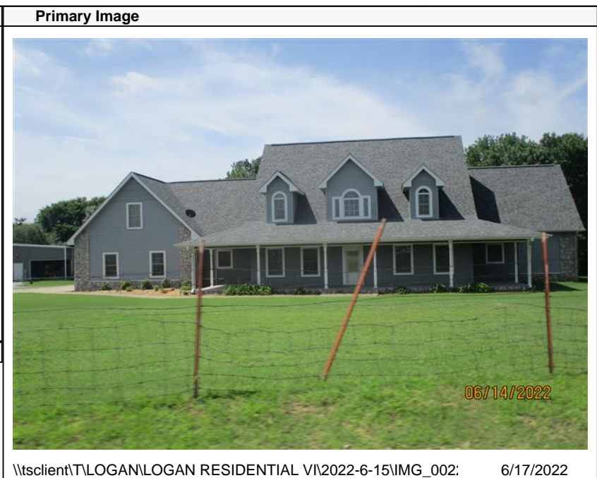
\\tsclient\T\LOGAN\LOGAN RESIDENTIAL VI\2022-6-15\IMG_002: 6/17/2022