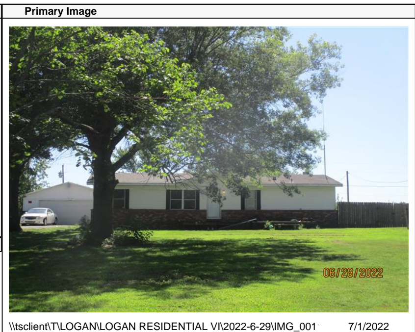
\\tsclient\T\LOGAN\LOGAN RESIDENTIAL VI\2022-6-29\IMG_001 7/1/2022