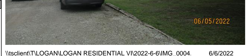
\\tsclient\T\LOGAN\LOGAN RESIDENTIAL VI\2022-6-6\IMG_0004. 6/6/2022