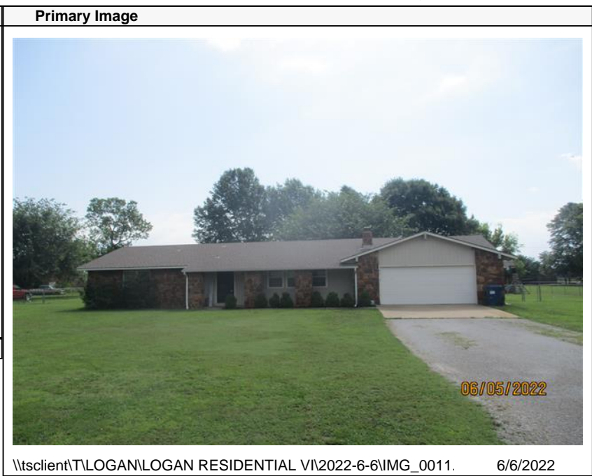
\\tsclient\T\LOGAN\LOGAN RESIDENTIAL VI\2022-6-6\IMG_0011. 6/6/2022