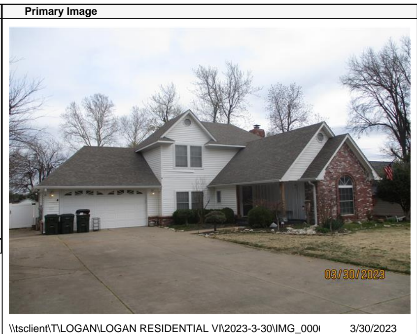
\\tsclient\T\LOGAN\LOGAN RESIDENTIAL VI\2023-3-30\IMG_0001 3/30/2023