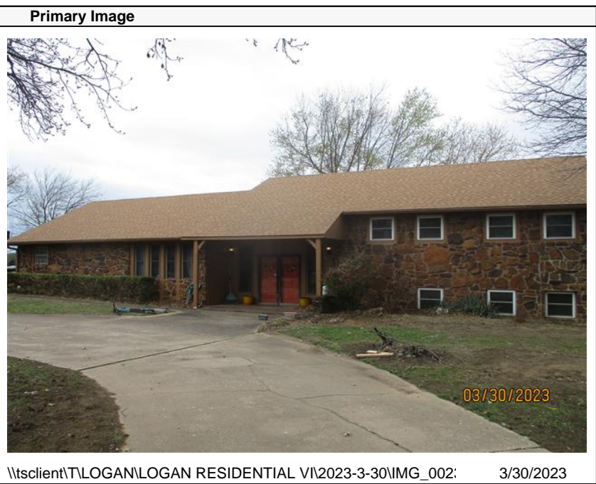
\\tsclient\T\LOGAN\LOGAN RESIDENTIAL VI\2023-3-30\IMG_002: 3/30/2023