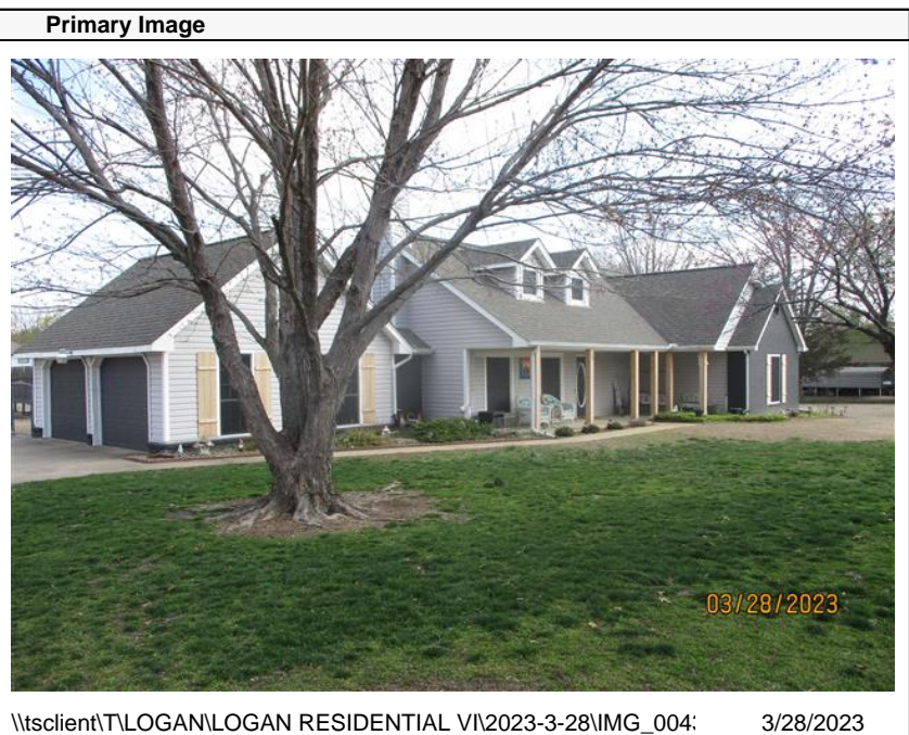
\\tsclient\T\LOGAN\LOGAN RESIDENTIAL VI\2023-3-28\IMG_004: 3/28/2023