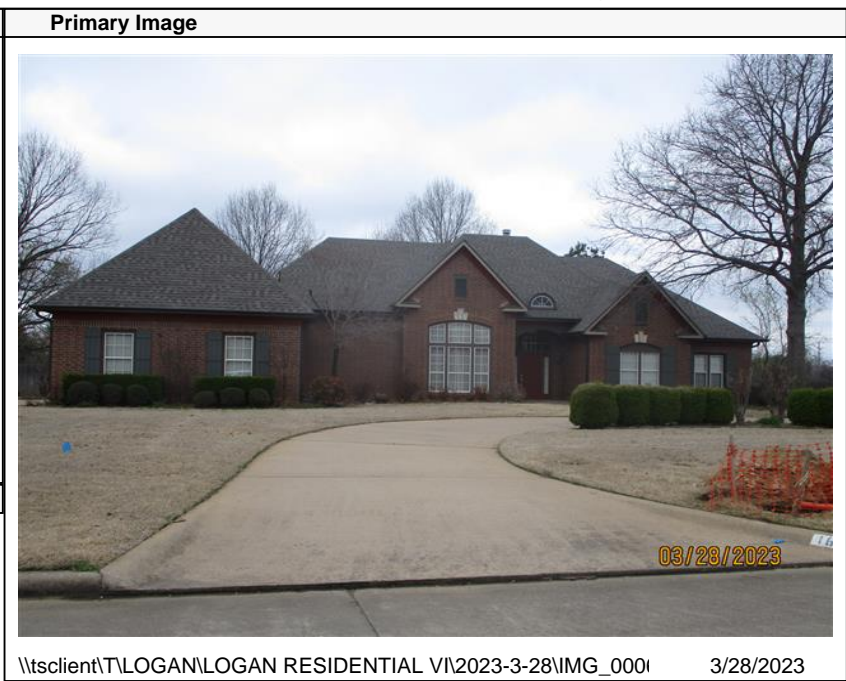
\\tsclient\T\LOGAN\LOGAN RESIDENTIAL VI\2023-3-28\IMG_0001 3/28/2023