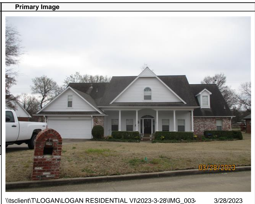
\\tsclient\TLOGAN\LOGAN RESIDENTIAL VI\2023-3-28\IMG_003 3/28/2023